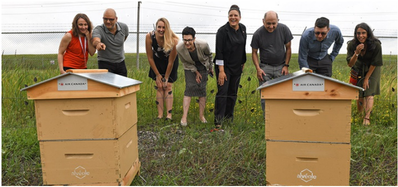
Jan 12, 2022